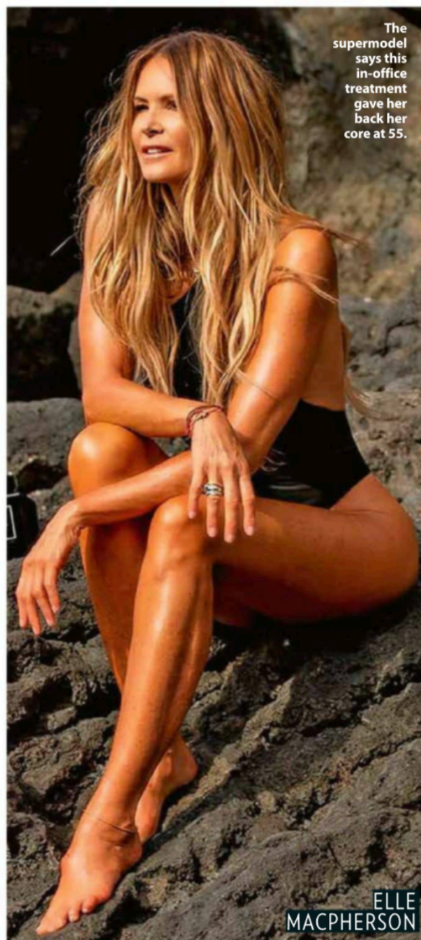
The supermodel says this in-office treatment gave her back her core at 55.

For more information, visit cuteraanz.com