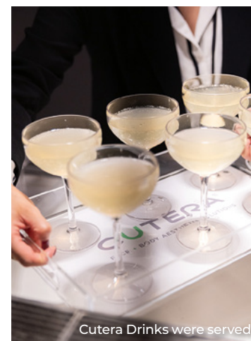
Cutera Drinks were served