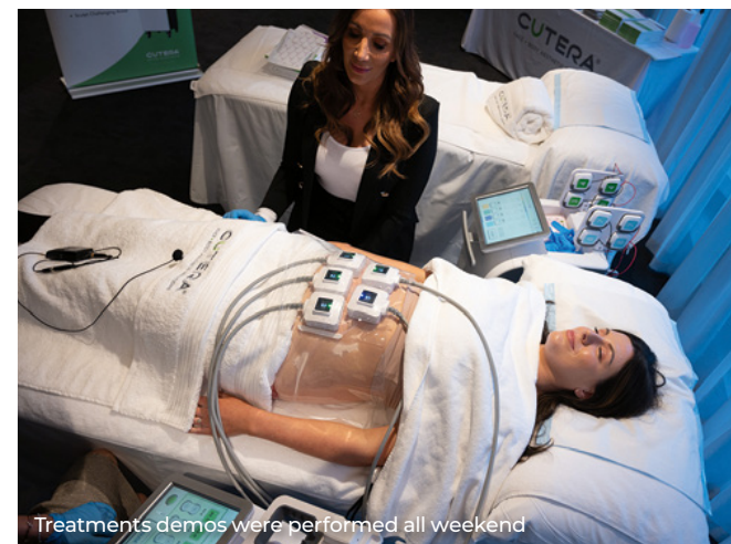
Treatments demos were performed all weekend

The highlight of CUCF for many was the Cutera VIP Cocktail Party held at Bond Bar. Delegates donned their finest black tie outfits and were clearly chuffed to dress up after a year without events, and were greeted with customised Cutera cocktails and a green and gold Cutera balloon media wall. A DJ and live saxophone player provided party tunes which kept guests on the dance floor all night.