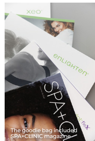
The goodie bag included SPA+CLINIC magazine