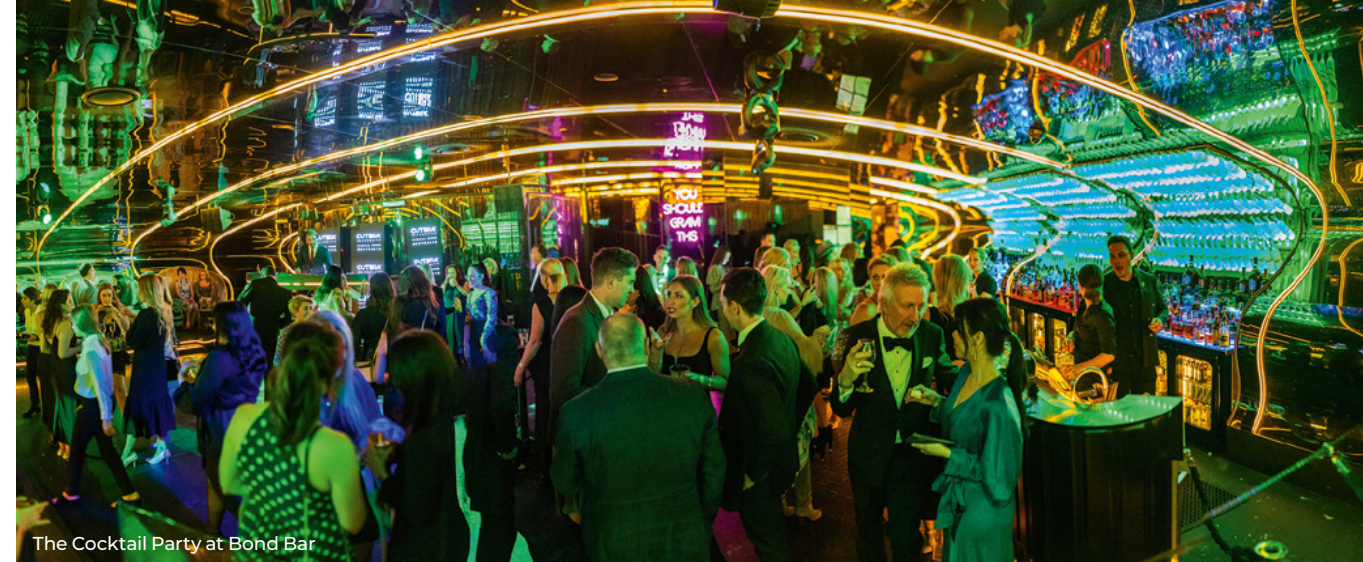
The Cocktail Party at Bond Bar