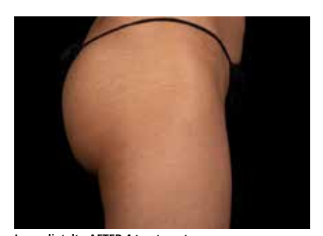
mmediatelty AFTER 4 treatments

For more information call 1800 288 372, visit cutera.com.au or email australia@cutera.com